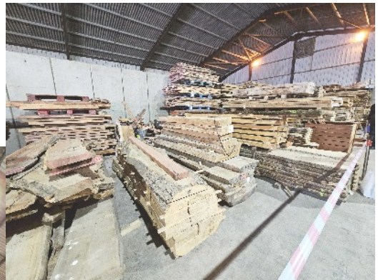
Below - Dalman Warehouse