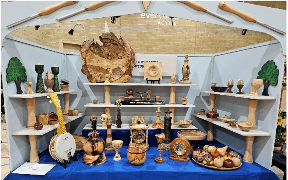
Above - West Northants stand.