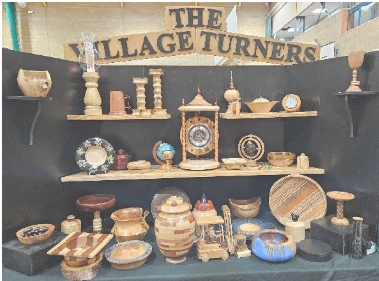
Below - Village Turners stand.