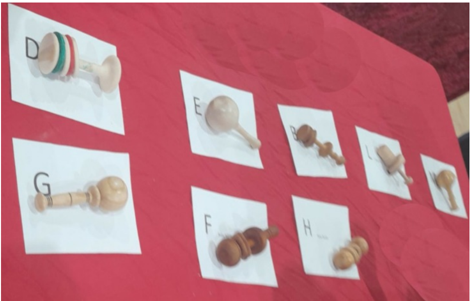
Below - Baby's Rattle Competition Entries