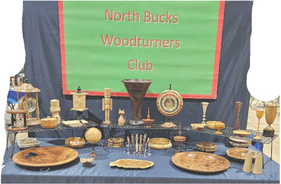
Above - North Bucks stand. Below - Offchurch stand.