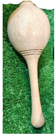
Above left - 1st place rattle. West Northants. Above middle - 2nd place rattle - North Warwickshire & Hinckley. Above right - 4th place rattle - Coombe Abbey.