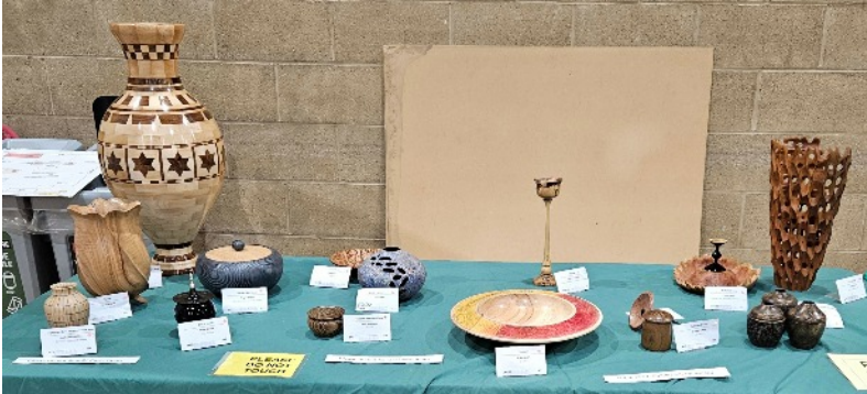
Above - AWGB