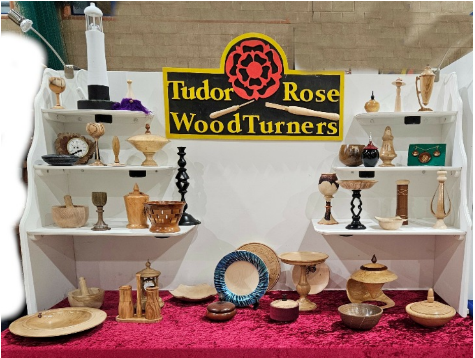
Above - Tudor Rose stand.