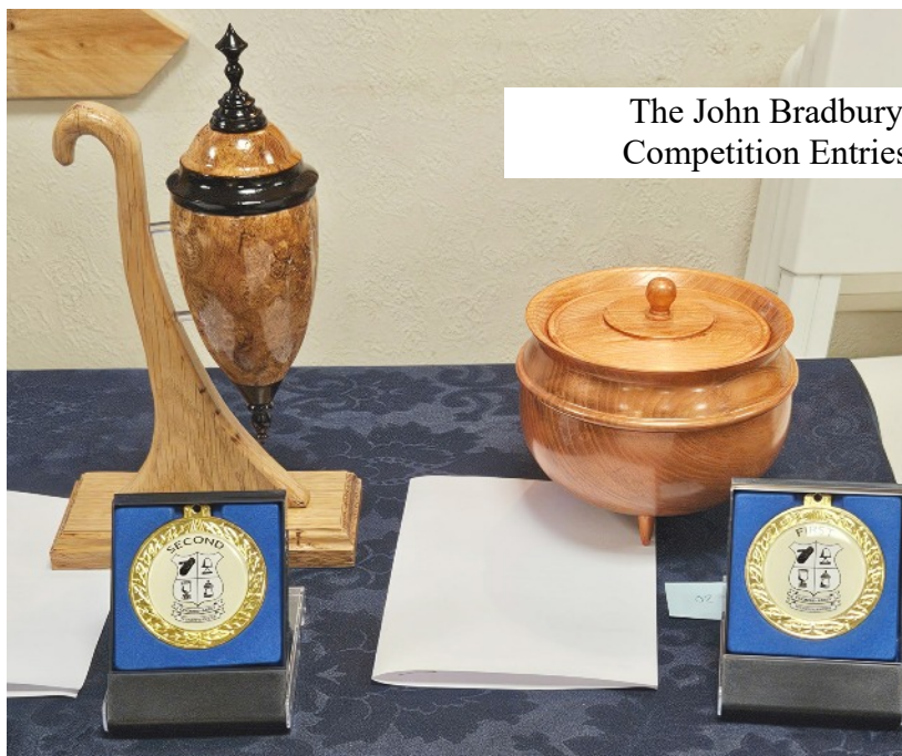
The John Bradbury Competition Entries