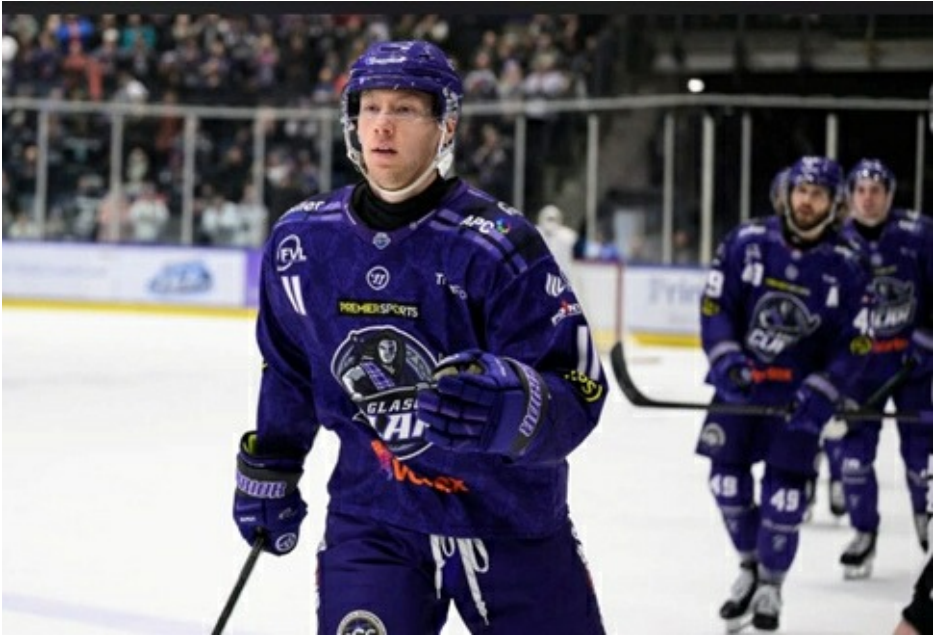
Austin #11 for Glasgow Clan