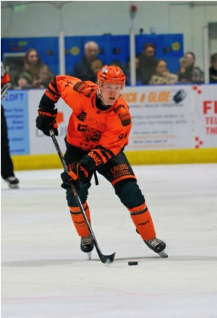
Rhodes for Telford Tigers #91