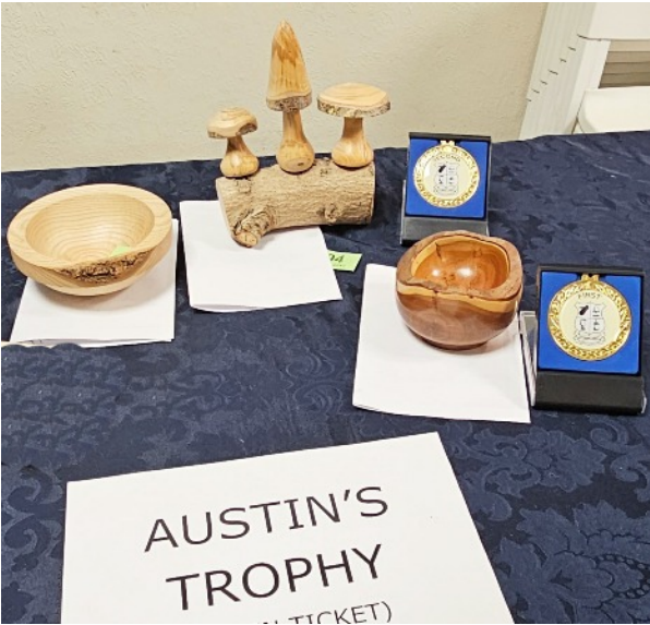
The Austin's Trophy Competition Entries