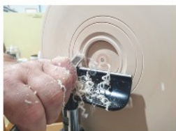
Woodturning 2-Day Course £245

Learn a new skill or enhance an existing one!