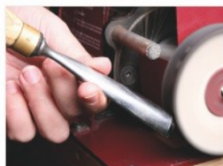
Tool Sharpening Half-Day Course £65