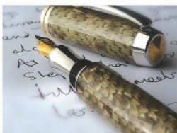
Pen Turning 1-Day Course £130