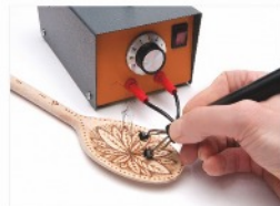
Pyrography 1-Day Course £130