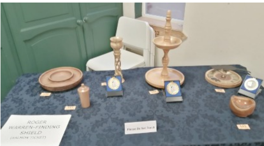
Roger Warren Finding Trophy Entries