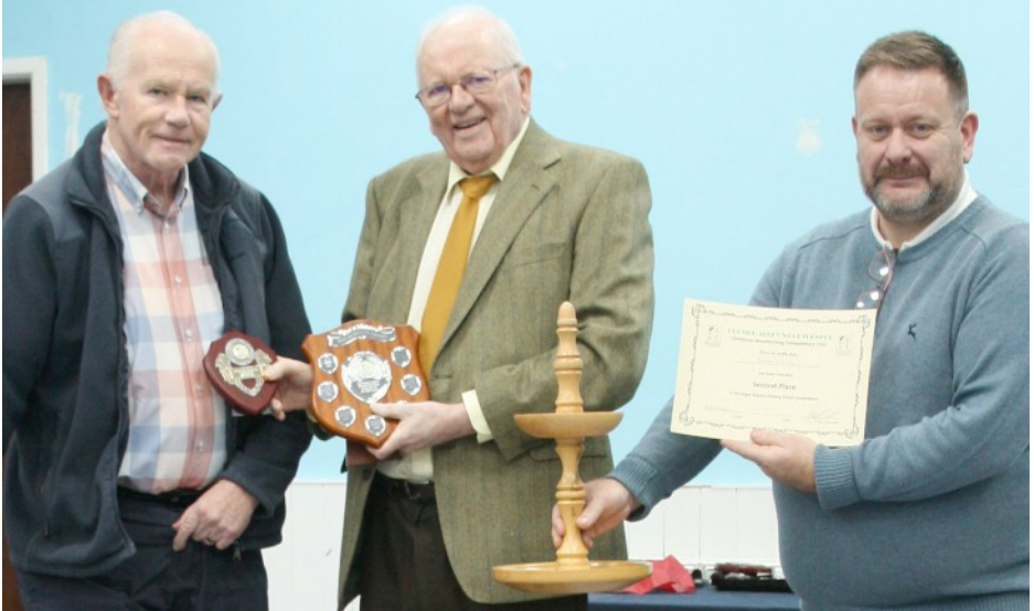
Brian Whyndray Plate Stand