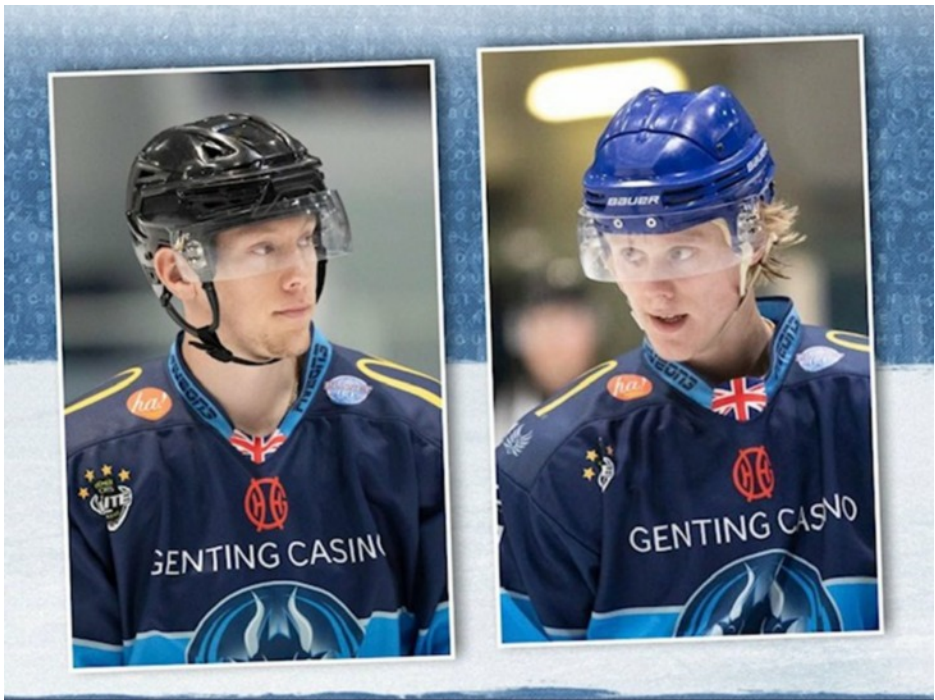
Austin #21 Coventry Blaze #24 Peterborough Phantoms