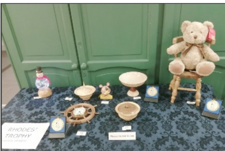
Rhodes' Trophy Entries