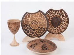
Surface Enhancement 1-Day Course £160