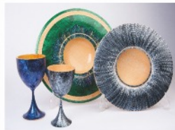
Colouring on Woodturning 1-Day Course £190