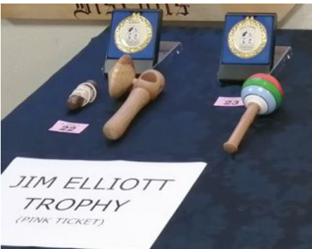
Jim Elliott Trophy Entries