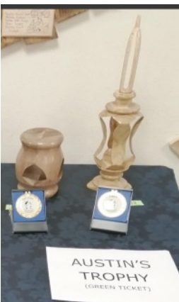
Austin's Trophy Entries